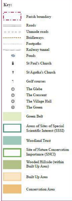
Map of Woldingham Parish